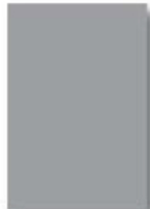
3-0770 Warm Gray